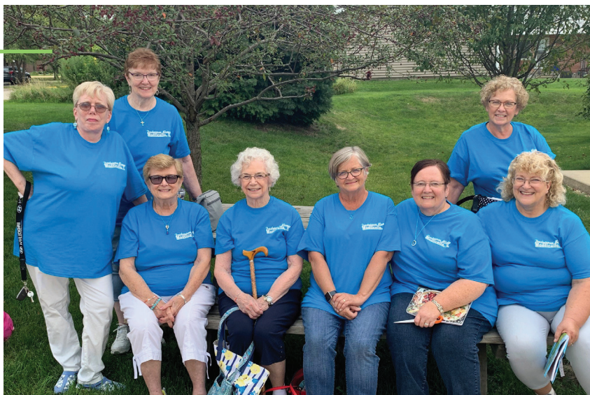
Monticello, Illinois Presbyterian Church Volunteer group

This past year, 125 volunteers gave 11,083 hours of their time to FOF and our clients. Volunteers support FOF in many different ways, including direct client services, administrative tasks, operations, fundraising, sorting donations, community outreach, and helping to spread our mission. We would like to thank each and every one of you who give your valuable time. Without you, we would not be able to do all that we do. From the bottom of our hearts, thank you!